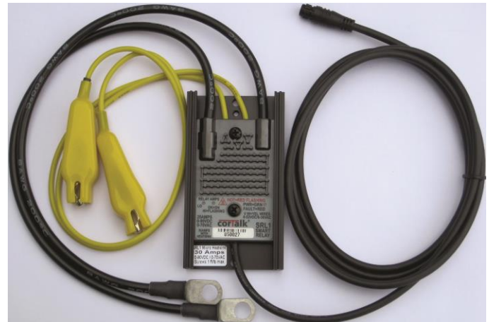
SRL1 on micro heatsink (A1506031501) – 30 Amps 0-90VDC / 0-70VAC