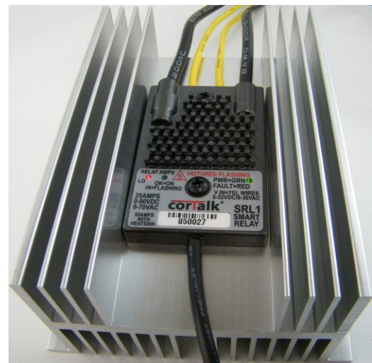
SRL1 on medium heatsink – 50 Amps 0-90VDC / 0-70VAC