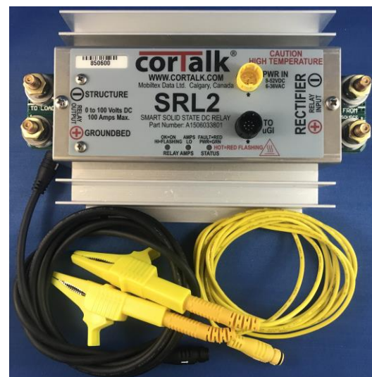
SRL2 Kit (A20A0333801) - 0-100VDC 100 Amps max